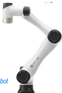
Collaborative robot Dobot CR5

Safety provided by the robot's collaborative function.