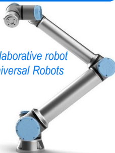
Collaborative robot Universal Robots