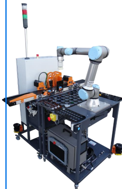
Collaborative Capping & Assembly Robot (Universal Robots UR5 eSeries)