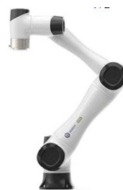
Dobot CR5 6-axis arm