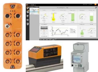
Electrical and pneumatic measurement sensors (IO-Link) for monitoring the power, flow and electrical and pneumatic consumption of a machine equipped with an IO-Link master (Ref: IO00)