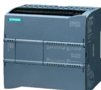
Programmable Logic Controller Industrial S7-1200