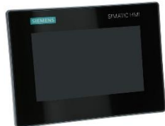
Human Machine Interface Siemens HMI MTP700 Unified