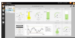
IO-Link Master and MONEO Configure sensor visualization and setting software