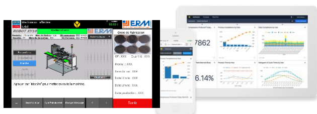
MES Tulip, Visual Instructions & Production Indicator Monitoring for the Line Manager (Ref: UC51)

IO00 : Electrical (Modbus-TCP) and pneumatic (IO-Link) measurement sensor package